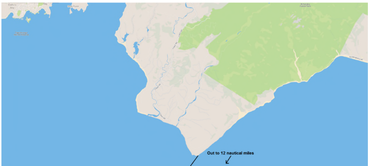
12 nautical miles out from the coastline by Turakirae Head.