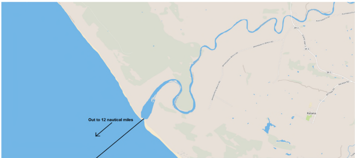
12 nautical miles out from the mouth of the Whangaehu River.