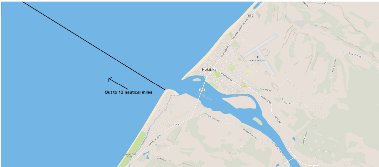
12 nautical miles out from the mouth of the Hokitika River.