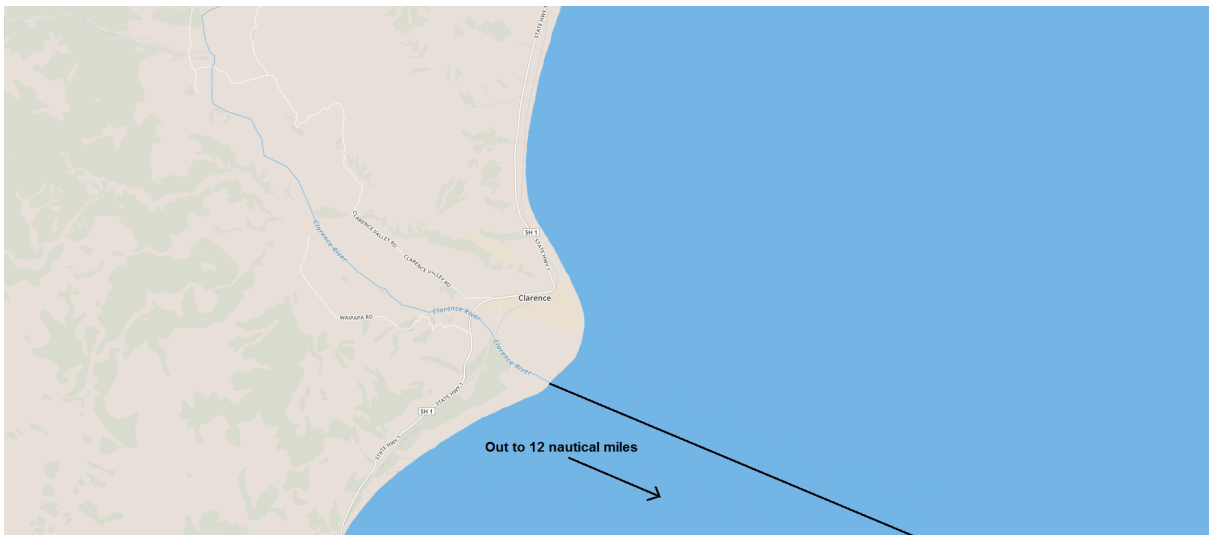
12 nautical miles out from the mouth of Waiau Toa / Clarence River.