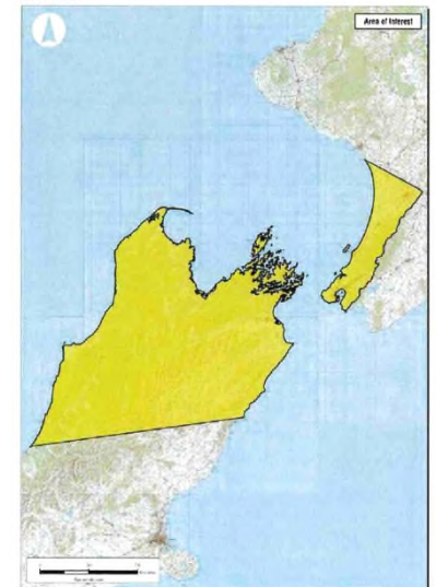
Original map of application area