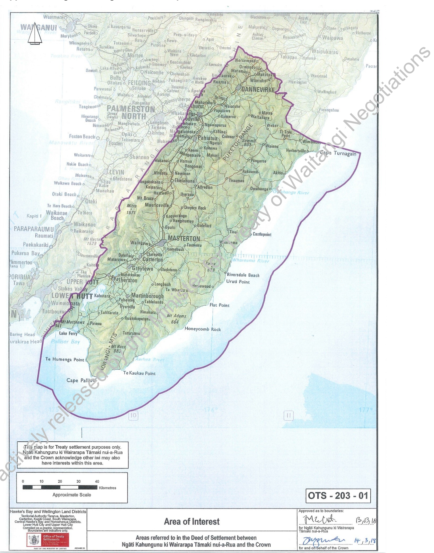
Appendix 1: Ngāti Kahungunu ki Wairarapa Tāmaki nui-a-Rua Area of Interest